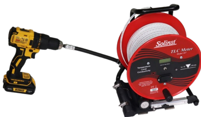
Solinst TLC Meter with Power Winder Installed to Make Temperature and Conductivity Profiling Applications Easier