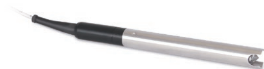
Model 122M P8 Probe

The 122M uses the P8 Probe, which is 16 mm (5/8") in diameter and stainless steel. It is pressure proof, up to 500 psi. The beam is emitted from within a Hydrex cone-shaped tip. The tip is protected by an integral stainless steel shield, and is excellent for the vast majority of product monitoring situations. A cleaning brush is included with each Meter.