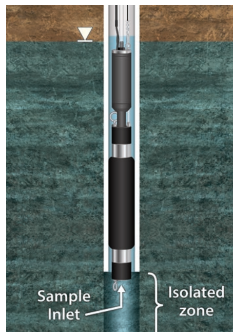
A Model 800M Packer can be used to isolate the sampling zone and reduce purge volumes.

Tag Line: Convenient reel-mounted marked cable, for measured depth deployments. (See Solinst Model 103 Data Sheet).