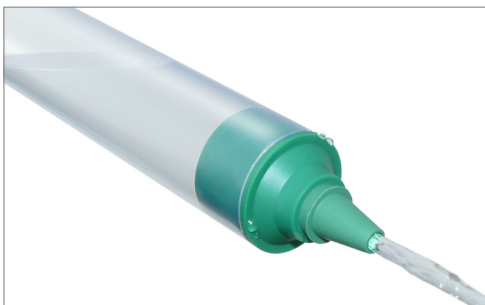
Model 428 BioBailer