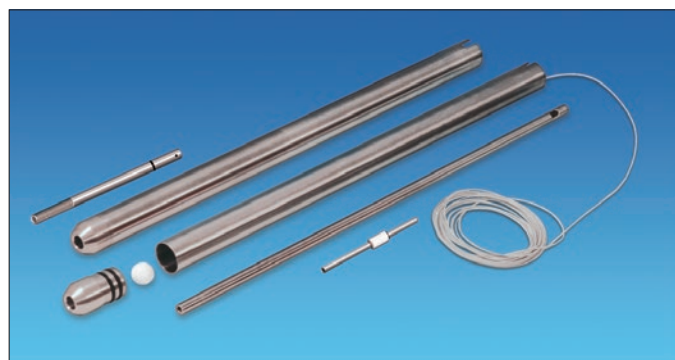
Point Source Bailers come in standard lengths of 2 ft. (610 mm), 3 ft. (910 mm), or 4 ft. (1220 mm)

The miniature 0.5" (12.7 mm) diameter model is ideal for use in narrow tubes and direct push devices.