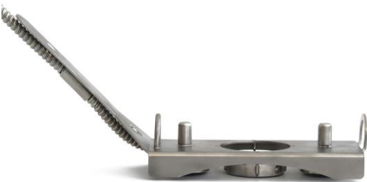
Figure 3 HF01 heat flux and surface temperature sensor with frame with magnets

HF01 heat flux sensor calibration is traceable to SI units. The factory calibration method follows the recommended practice of ASTM C1130. The recommended calibration interval of heat flux sensors is 2 years.