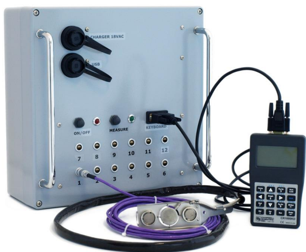
Figure 1 the ALUSYS measuring system, for trend - monitoring and comparative surveys of heat flux and surface temperature in industrial environments. Connected to the MCU: one HF01 sensor, as well as the Keyboard Display.

ALUSYS is a measuring system for trend-monitoring and mobile survey of heat flux and surface temperature in industrial environments. Sensors and electronics have the robustness necessary for this application. Powered from a low-voltage rechargeable battery, it is easy and safe to use. In its standard configuration the system consists of an MCU Measurement Control Unit in a metal housing and 12 x heat flux and surface temperature sensors of model HF01. Measured data are stored for later analysis.