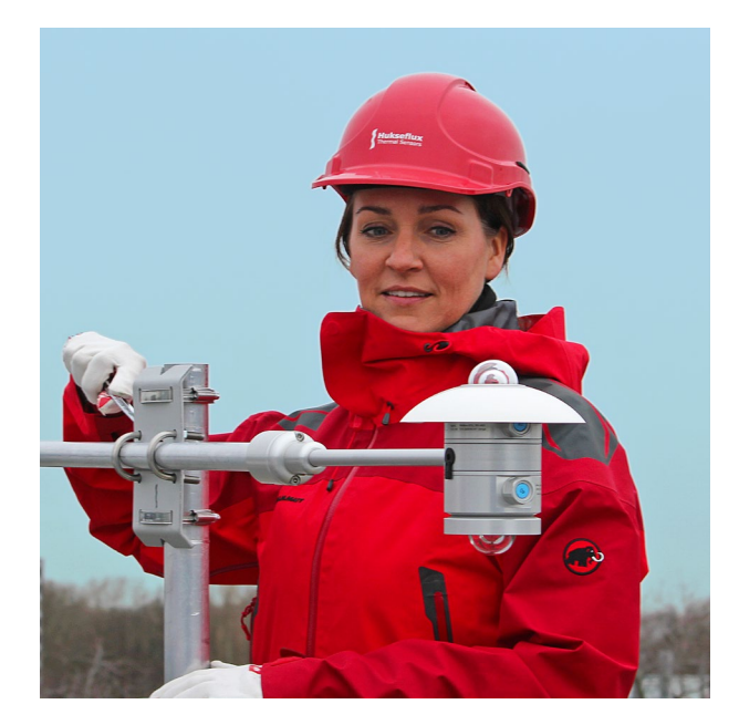
Figure 6 installation of AMF02 albedometer mounting kit and two SR20 pyranometers, mounted with ALF01 levelling fixture on a crossarm with crossarm bracket CMF01.