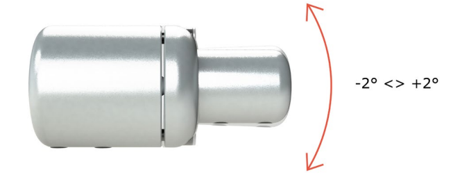
Figure 2 ALF01 albedometer levelling tool, can be rotated around the axis of the crossarm to which it is connected, and tilted over \pm 2 °.