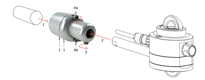
Figure 4 ALF01 allows levelling when mounting an albedometer rod onto a crossarm

Copyright by Hukseflux. Version 2114. We reserve the right to change specifications without prior notice Page 2/3. For Hukseflux Thermal Sensors go to www.hukseflux.com or e-mail us: info@hukseflux.com