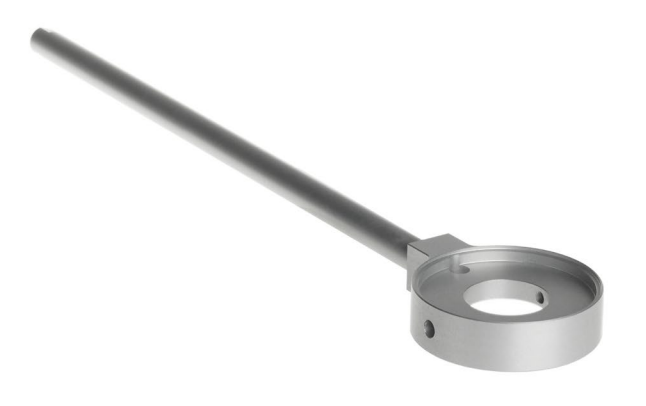
Figure 1 AMF02 or AMF03 albedometer kits are used to mount both an up- and a downfacing pyranometer, and construct an albedometer. The image shows the AMF02 mounting fixture and its rod. A glare screen for the downfacing sensor is also included.

Hukseflux offers a full range of dedicated, ready-to-use albedometers for measuring albedo. Alternatively, with the AMF03 or AMF02 mounting fixture in AMF / ALF series, you may choose to construct albedometers from popular Hukseflux pyranometers yourself. AMF03, AMF02 and SRA series albedometers can be levelled with ALF01 levelling fixture.