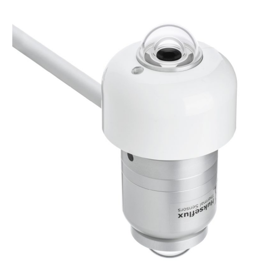
Figure 5 the end result using AMF03 and two SR30-M2-D1 pyranometers: SRA30-M2-D1 albedometer