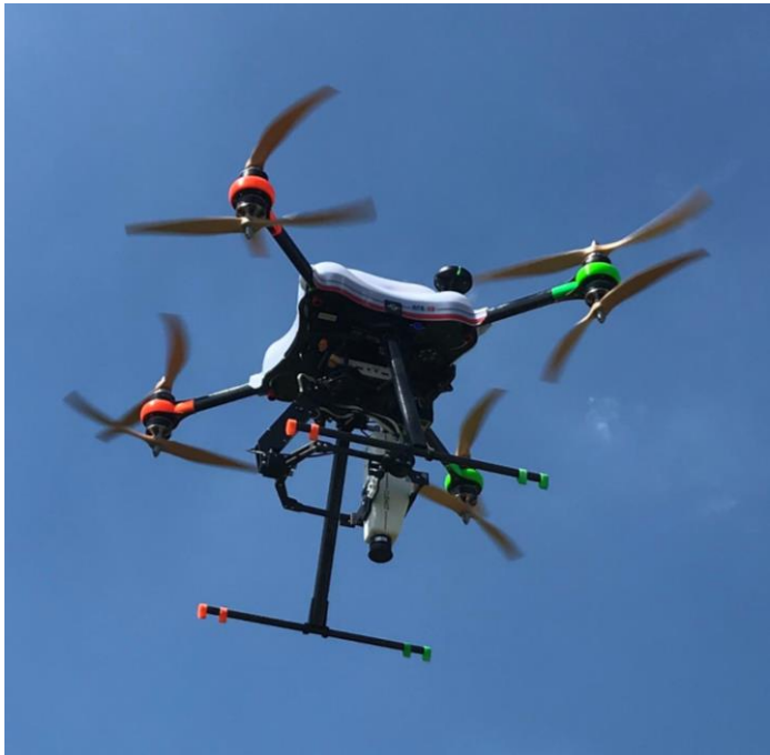
FirefLEYE 185 mounted on a UAS