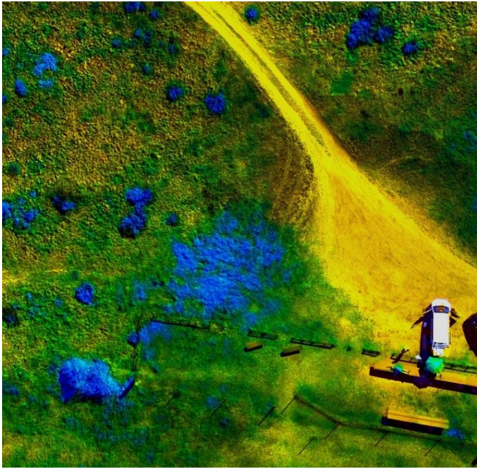
Hyperspectral Mapping with the FirefLEYE 185