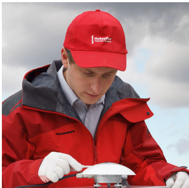
Figure 3 IR20 pyrgeometer being prepared for application