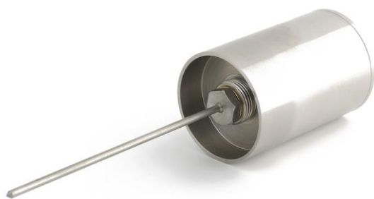
Figure 2 MTN02: Mounted on insertion tool IT03, the thermal needle TP07 is inserted into the soil.