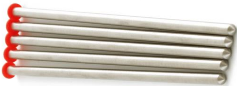
Figure 3 GT03 guiding tubes (not included)

Suitable for hard soils and concretes: use MTN02 in combination with GT03 Guiding tubes (ordered separately in sets of 5). Using these tubes it is possible to measure in hard materials such as cements and thermal backfill (heavy clay) and dried-out soil by casting them into specimens.