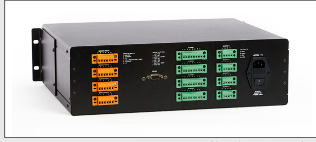
Rear panel input/output connections

The Control Unit in the multi-channel format can also include a moisture in gas analysis or oxygen measurement function by combining with the Promet I.S. Moisture in Gas Analyzer or the Minox-i O_2 transmitter.*