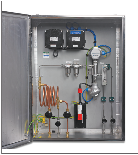
Liquidew I.S Sampling system

The design of the Liquidew I.S. Premium Sampling System has drawn on Michell's 40+ years of expertise in online process gas analyzers. Particulate filtration is provided in single or dual stages so that sensor and system performance is maintained even in processes prone to contamination. A panel-mounted version of the sampling system and sensor are offered for internal installations, while various enclosures and heating options are available for field installation next to the sample source. Sample cooling, using a water heat exchanger, is available for process fluids at elevated temperature.