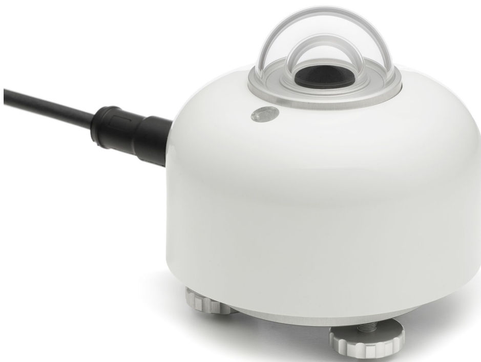
Figure 1 SR15 spectrally flat Class B pyranometer series.

SR15 pyranometer series is a range of high-accuracy solar radiation sensors. It is "spectrally flat Class B", according to the ISO 9060:2018 standard. Various outputs are available, both digital and analogue. Versions SR15-D1 and SR15-A1 are equipped with an on-board heater, mitigating dew and frost.