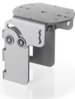
Figure 4 PMF01 mounting fixture accessory: practical, small footprint, and allowing horizontal and Plane of Array installations on various platforms.

WMO, the World Meteorological Organization, recommends use of Class B (first class) pyranometers such as SR15 for network operation.