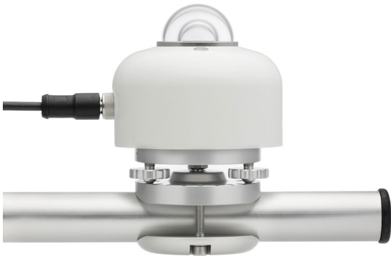
Figure 7 SR15 with optional tube levelling mount.

About Hukseflux Hukseflux is the leading expert in measurement of energy transfer. We design and manufacture sensors and measuring systems that support the energy transition. Hukseflux products and services are offered worldwide via our office in Delft, the Netherlands and local distributors.