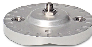
Figure 6 Several mounting options are offered, such as this spring-loaded levelling mount for easy mounting, levelling and instrument exchanges on flat surfaces.