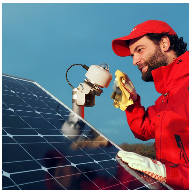
Figure 2 SR15 pyranometer mounted in POA (Plane of Array) on a mast for PV performance monitoring.