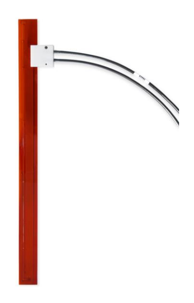
Figure 1 STP01 soil temperature profile sensor is applied in many large scale networks.

STP01 accurately measures the temperature profile of the soil at 5 depths close to its surface. It is used for scientific grade surface energy balance measurements. The sensor is buried and usually cannot be taken to the laboratory for calibration. The on-line self-test using the incorporated heating wire offers a solution to verify STP01's measurement stability.