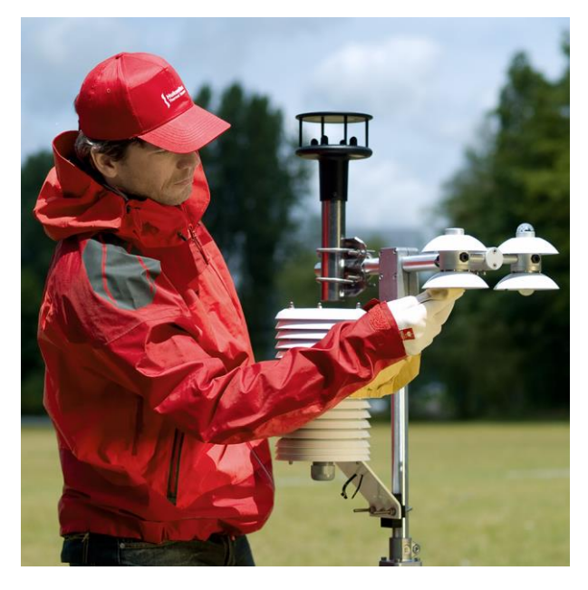
Figure 2 STP01 is often used in meteorological surface energy flux measurement stations