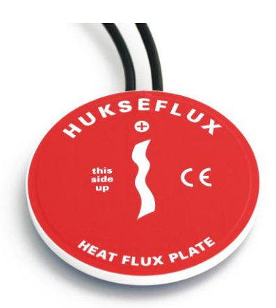
Figure 4 STP01 is often used in combination with HFP01SC self-calibrating heat flux sensor, shown in the picture