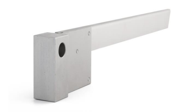
Figure 3 IT01 insertion tool is hammered down into the soil. After retracting it leaves a slit in which STP01 may be inserted

For ease of installation with a minimum of disturbance of the local soil, Hukseflux offers IT01 insertion tool.