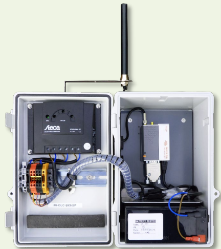
3G-DLC-BX1/SP and 3G-BX1/SP Modem Box

Please note that the logger (ordered separately) has to be mounted outside the modem box. A Data Package is also required to complete the system. To ensure the system meets your needs, please request a quotation before ordering.