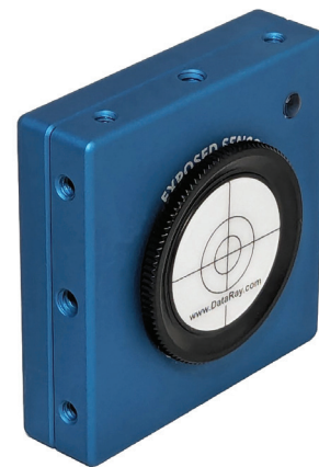
BladeCam2 1.8 x 1.8 x 0.5 in 46.0 x 46.0 x 12.8 mm

The BladeCam2™ is paired with DataRay's full featured, highly customizable, user-centric software which has no license fees, unlimited installations, and free software updates. It is perfect for applications including: CW laser profiling; field servicing of laser systems; optical assembly; instrument alignment; beam wander and logging; R&D; OEM integration; quality control; and M 2 measurement with available M2DU stage.