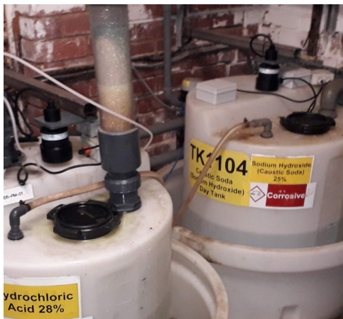
dBR8's reading through the plastic lid of a chemical tank.