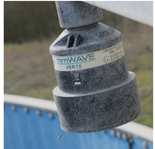
dBR16 on a foamy aeration tank.

Radar measurement will produce more stable results than ultrasonic sensors with limited acoustic power on foamy applications. This is because the foam interrupts the signal of the ultrasonic transducer; you can still get around this issue with ultrasonic measurement by using a sensor with high acoustic power. However, one thing that both technologies have in common is that it is virtually impossible for them to see through the foam to the liquid surface.